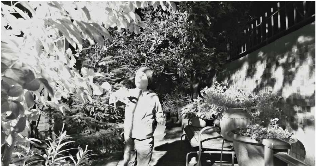
LAV DIAZ: «THE BOY WHO CHOSE THE EARTH». VIENNALE TRAILER 2018