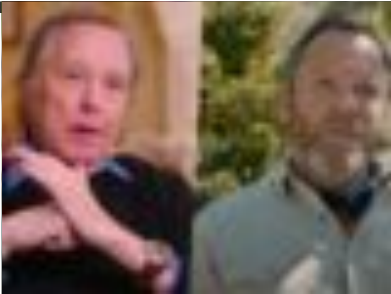
( https://theplaylist.net/william-friedkin-to-direct-kiefer-sutherland-in-a-remake-of-the-caine-mutiny-court-martial-20220829/ )