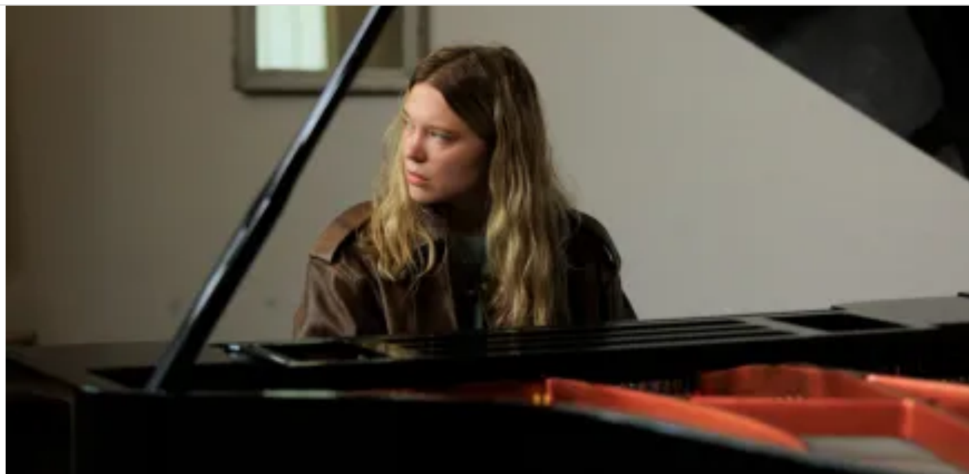
Léa Seydoux in 'Gentle Monster.'